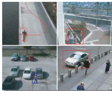
Video Content Analytics

Full Interaction with camera, including playback controls, optical and digital PTZ