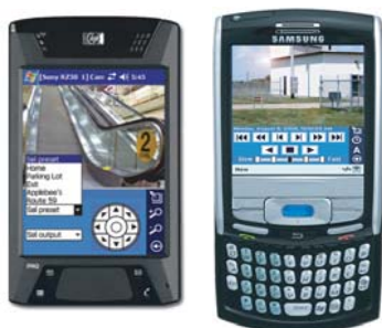
NetPDA & NetCell

PTZ-enabled Handheld IP Video clients/controllers