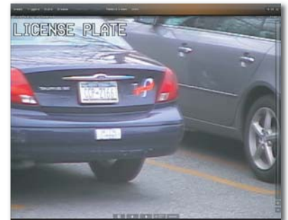
Live monitoring with instant investigation in Ocularis Client Lite

The Power of IP Video Surveillance IP-Based surveillance means that cameras can be securely monitored, recorded, administered and accessed from any authorized workstation or portable device within the local network or over the Internet. With NetDVMS, the most powerful IP-based solution by far, OnSSI has established its leadership in the new era of surveillance management systems.